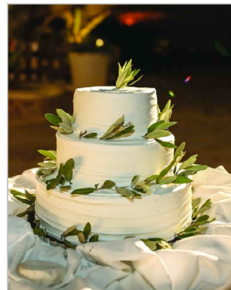
A stylish cake adorned with olive foliage