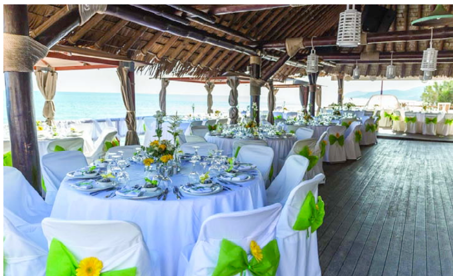
Any colour theme can be arranged to decorate chairs and tables