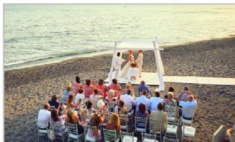
Beach weddings take place in the evening