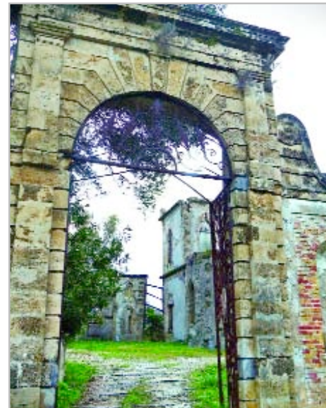
Beautiful archway, perfect for photographs