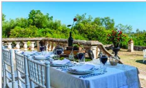
The top table can be set up at the top of the Mansion's steps