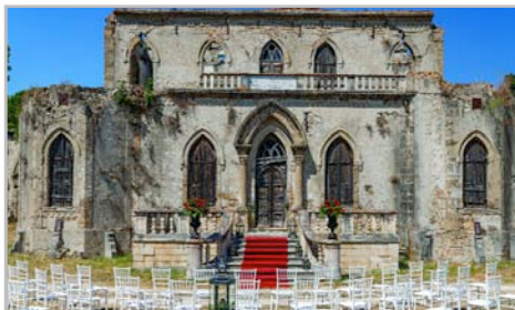
The Mansion is an enchanting wedding venue