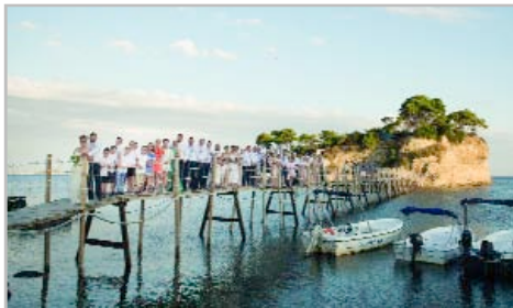
Reach the island by boat or walk along the bridge