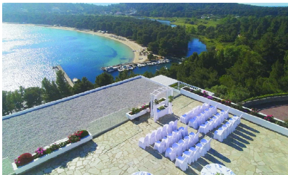
When location truly matters!