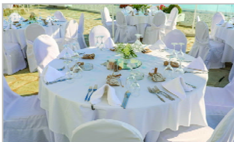
Your reception can also take place on the panoramic terrace