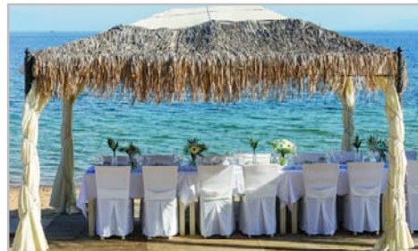
A very boho-chic setting for your wedding reception