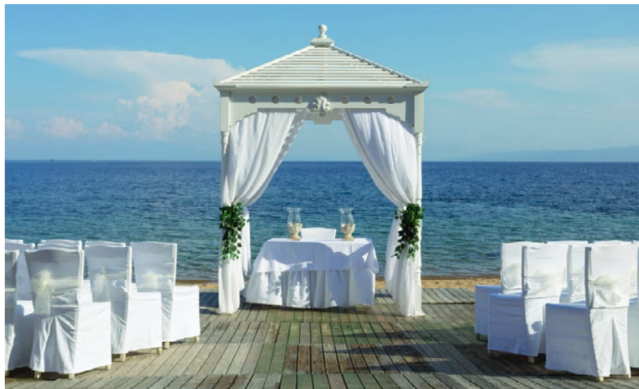
Stylish beach wedding ceremony