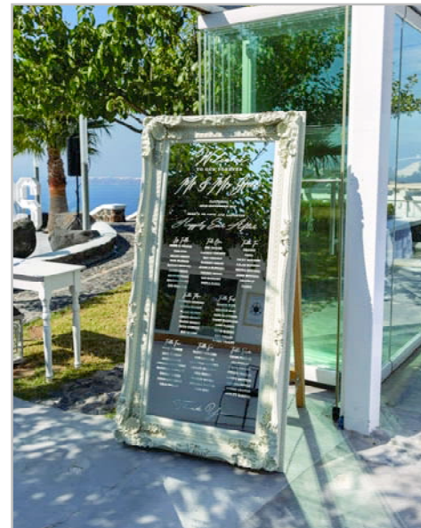
A very stylish table plan display