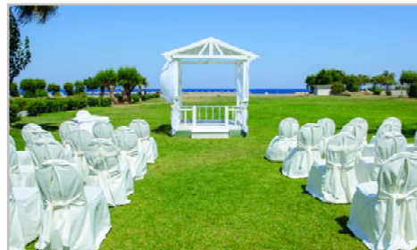
Preparations for a garden wedding at Atrium Palace (Kalathos)