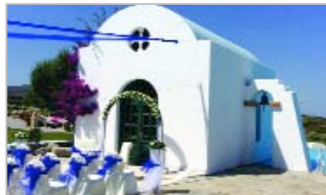
Say "I do" by the pretty chapel at Atrium Prestige (Lahania)