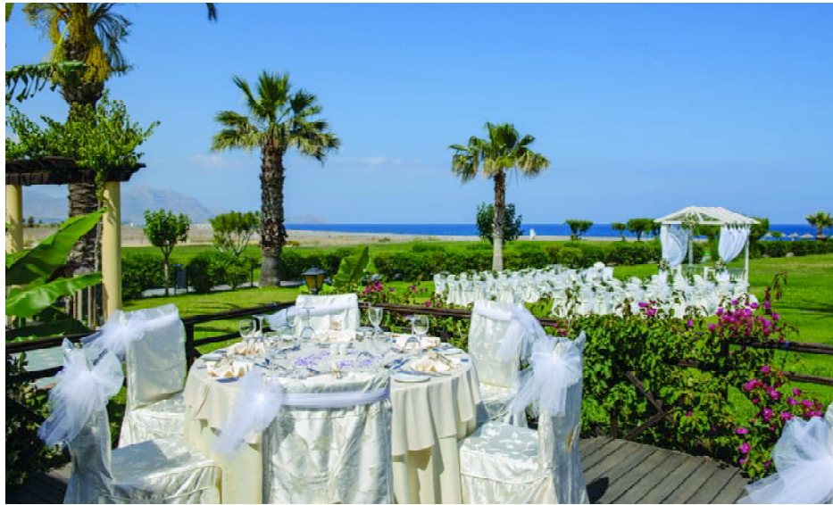
Wedding with a sea view and a chance to enjoy your reception a few paces away at Atrium Palace (Kalathos)