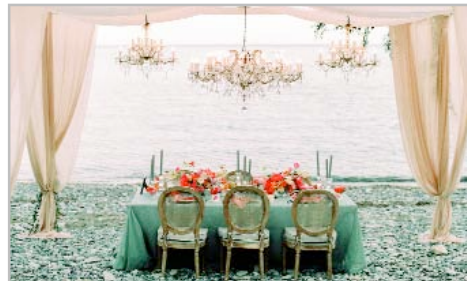
A very intimate setting, right by the waterfront