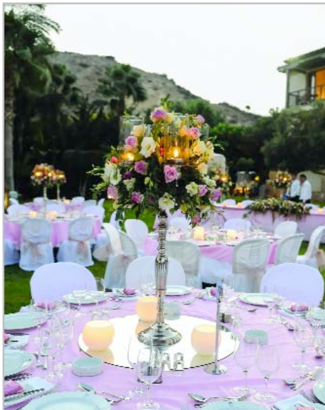
Romantic reception set up at dusk