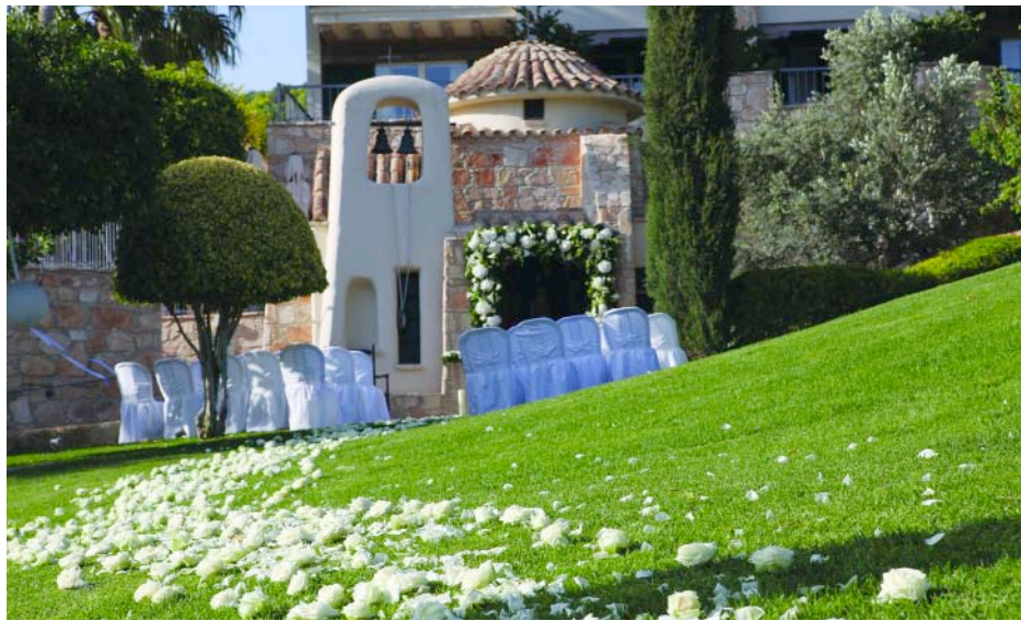
All Saints Chapel within the grounds of the resort is a popular wedding venue

With its spectacular outlook over the bay of Pissouri, Columbia Beach Resort is an idyllic nuptial location and a wonderful choice for your honeymoon too. There's also a fabulous spa for all the pampering you may wish before or after your wedding day: