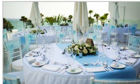
Wedding reception on the sea view Agape Terrace