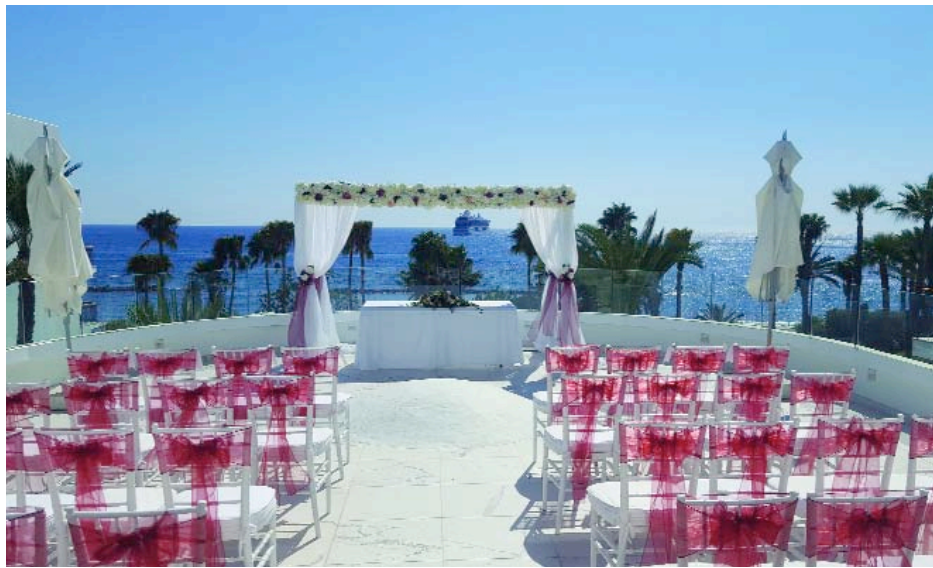
Wedding ceremony on the Agape Terrace