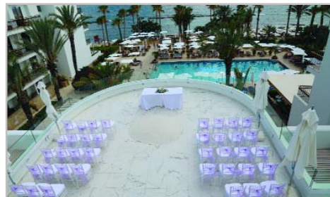
Sea views from Agape Terrace

♥ CIVIL WEDDING ♥ ANGLICAN WEDDING / RELIGIOUS BLESSING ♥ SAME-SEX SYMBOLIC CEREMONY