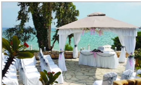
The Thalassaki Gazebo