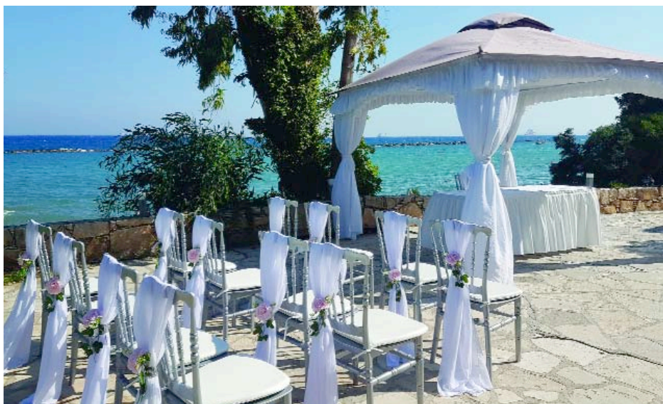
The stunning sea view terrace adds to the romance of a wedding day