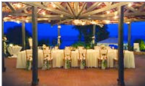
A stylish venue for your evening wedding reception