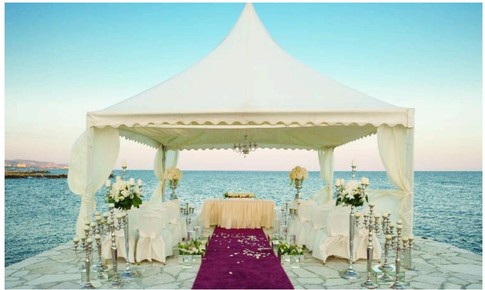
Ceremonies can take place on the Hotel Pier