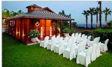
St George's Chapel is a beautiful option for your wedding