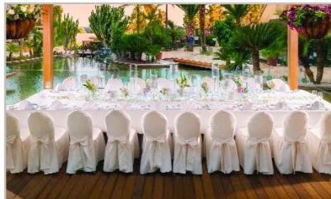
A very elegant setting for a wedding reception