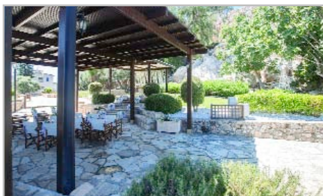
An utterly charming setting for up to 50 seated guests

This picturesque wedding venue in Protaras means that we can offer couples the chance to enjoy a civil ceremony outdoors instead of a local town hall. St Elias Garden Venue has been very nicely put together and comes complete with a shaded area within lush grounds planted with shrubs and palm trees just at the bottom of the rock on which sits the famous and very pretty chapel of Ayios Elias that dominates the area.