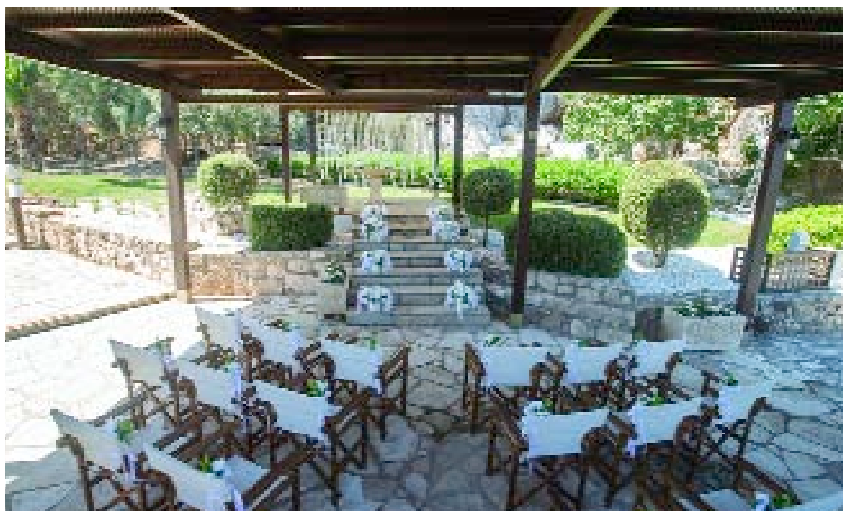
A pretty ceremony venue under the shade