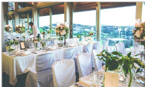
Very lavish preparations for a wedding reception