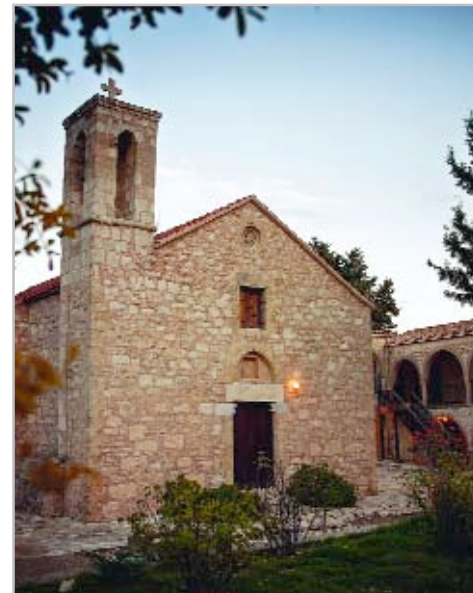
The chapel at dusk