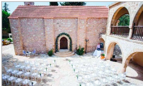
Ceremony set up within the cloisters of the monastery