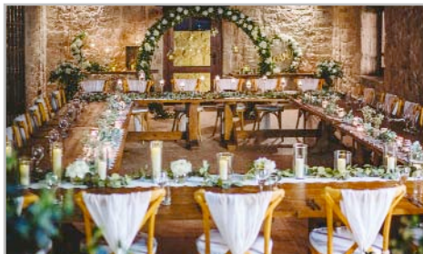
Your reception can take place indoors or outdoors