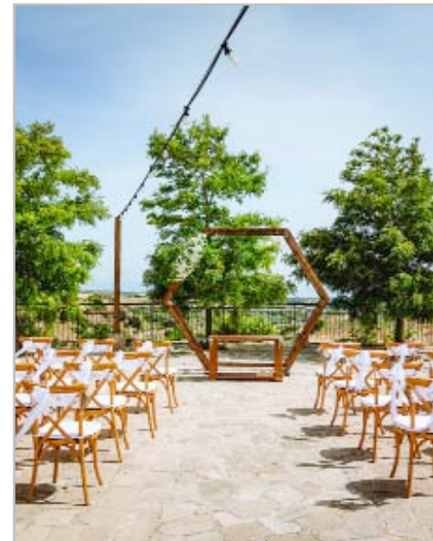
Preparations for a wedding ceremony