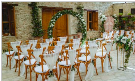
Ceremonies can take place in different areas of the terrace