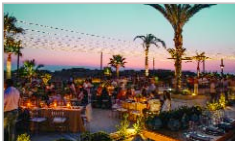
Outdoor wedding reception