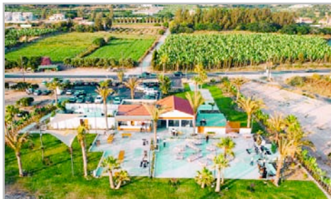
Spacious and perfect for private weddings