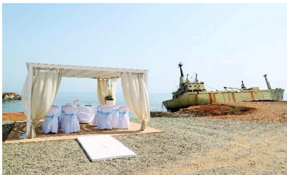
A very unique wedding ceremony location