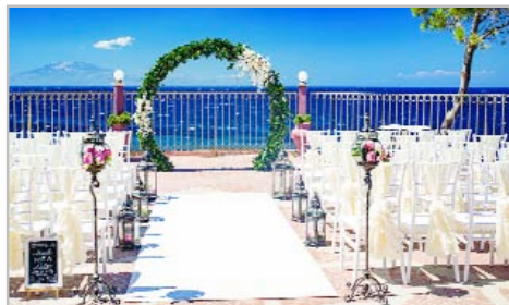
Stylish round arch

Located on a hilltop with direct access to the stunning beach of Tsilivi 20m below, Balcony Hotel offers an amazingly panoramic setting for your wedding day. With the ceremony taking place on a paved terrace, you and your guests can indeed make the most of this magnificent backdrop and, of course, the views of the bay will also add the perfect 'overseas wedding touch' to your photo album!