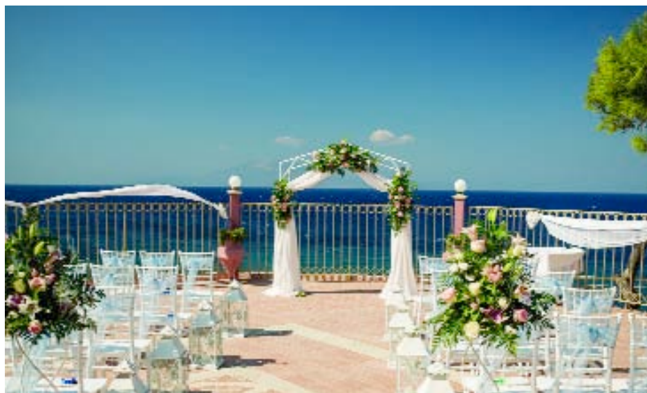
Magnificent sea view guaranteed