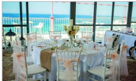
Decorations to suit your colour theme