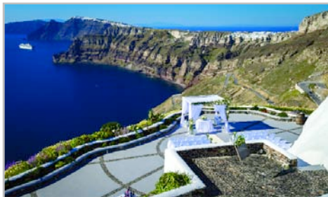
Such a gorgeous and private setting