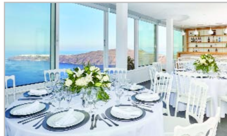
Wedding reception with a sea view