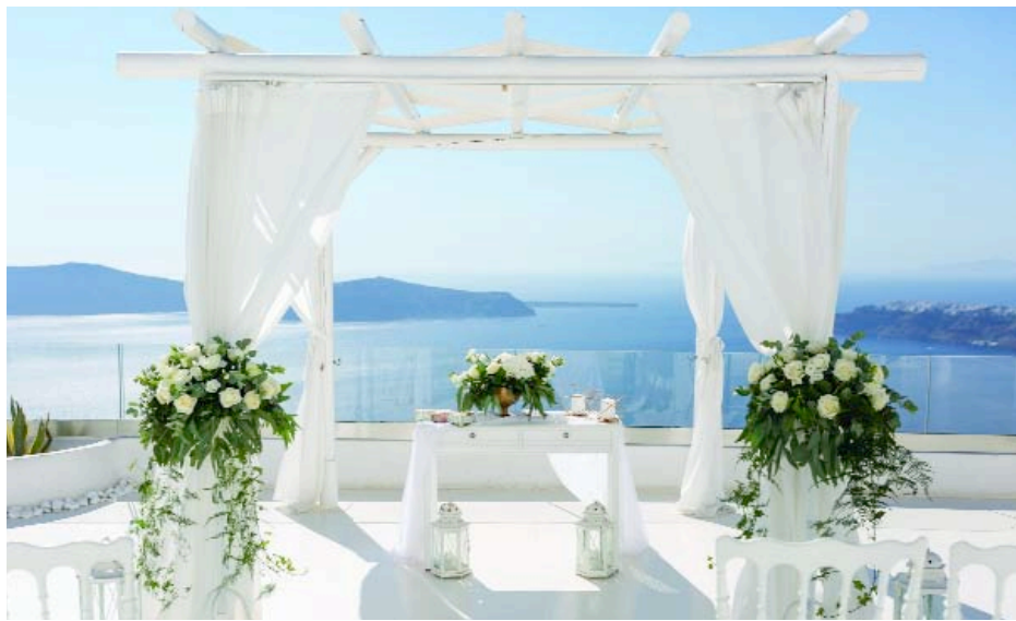
The whiter than white terrace, standing above the sea, provides a wonderful setting for wedding ceremonies