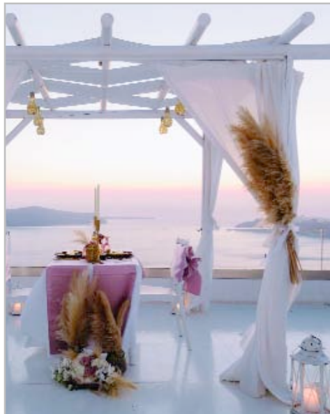
Very individual and striking decorations of the venue