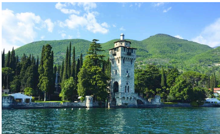
Right by the shore of Lake Garda