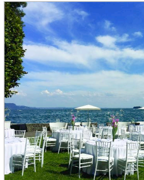
Your wedding reception can take place outside