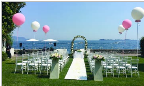
Stylish ceremony venue with wonderful lake views