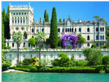
Such a beautiful location for your wedding day