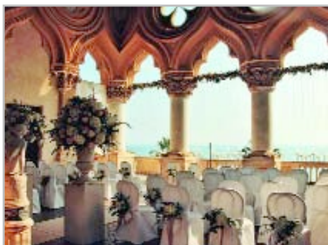
Huge attention to detail in the setting of this wedding ceremony