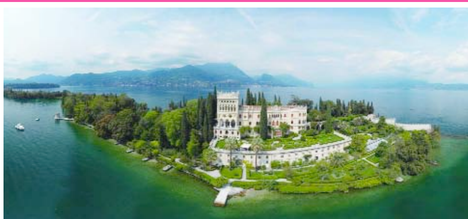
A magnificent aerial view of Isola del Garda