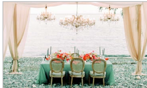
A very intimate setting, right by the waterfront