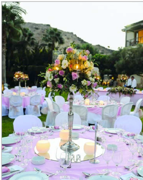
Romantic reception set up at dusk