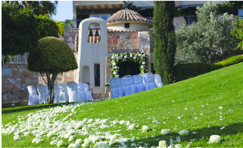
All Saints Chapel within the grounds of the resort is a popular wedding venue

With its spectacular outlook over the bay of Pissouri, Columbia Beach Resort is an idyllic nuptial location and a wonderful choice for your honeymoon too. There's also a fabulous spa for all the pampering you may wish before or after your wedding day: