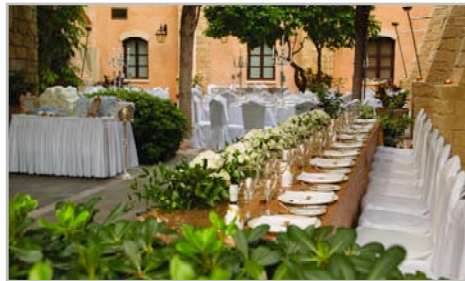
A stylishly laid out wedding reception