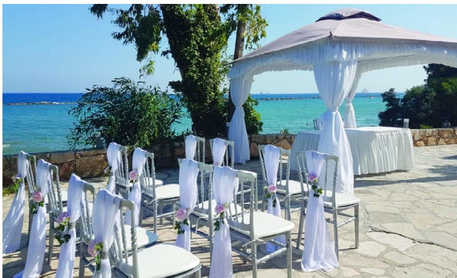
The stunning sea view terrace adds to the romance of a wedding day