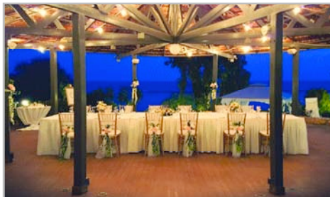
A stylish venue for your evening wedding reception