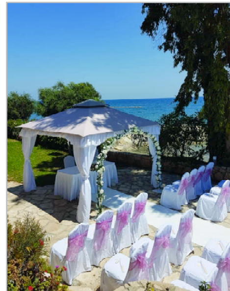
Gazebo and chairs can be dressed to suit your requirements