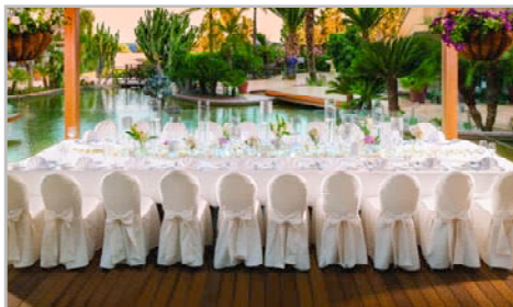
A very elegant setting for a wedding reception