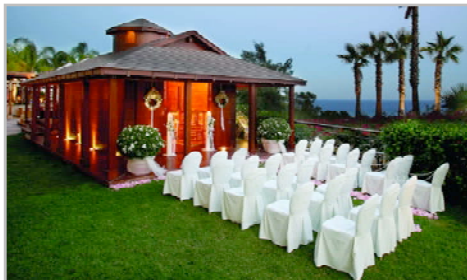
St George's Chapel is a beautiful option for your wedding