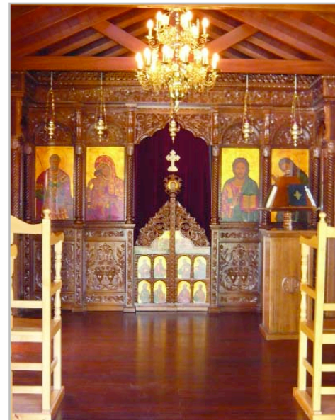
The stunning interior of St George's Chapel