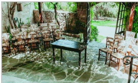
The ceremony could take place under the vine covered pergola