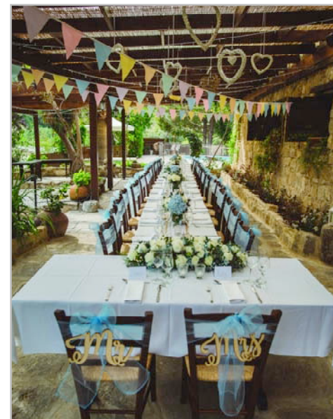
Fairy lights add to the charming and rustic set up