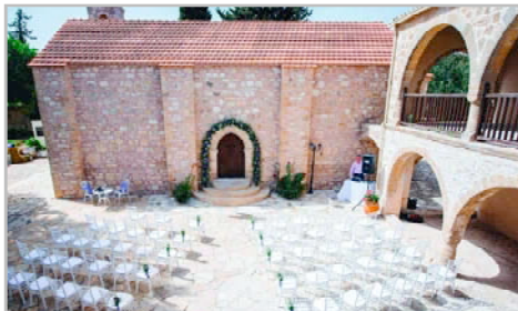
Ceremony set up within the cloisters of the monastery