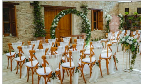
Ceremonies can take place in different areas of the terrace