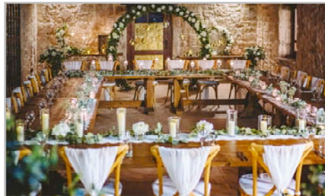
Your reception can take place indoors or outdoors