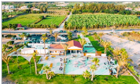
Spacious and perfect for private weddings