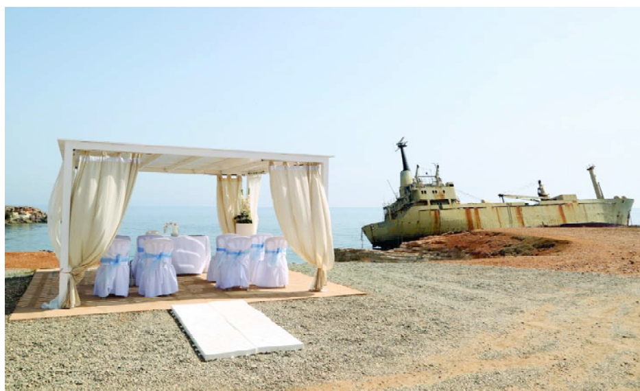
A very unique wedding ceremony location