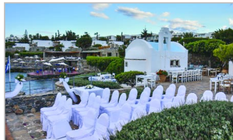
Preparation of the wedding venue for late afternoon ceremony