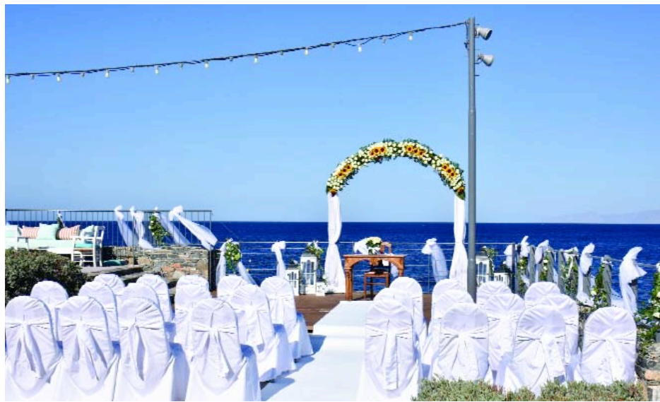
An enchanting seaview setting

If you're seeking an enchanting location to experience your dream wedding, the luxurious St Nicolas Bay offers everything you may wish for, plus all the 'know how' to wow you and your guests. A comprehensive package has been put together for couples arranging their wedding and stay (minimum 5 nights), which we highly recommend. Another package option, with less inclusions, is available for non-residents. With the ceremony taking place late afternoon on a panoramic terrace located next to the picturesque chapel, a splendid sea view setting is guaranteed for the start of your married life.