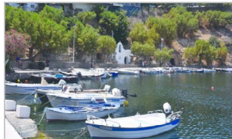
An enchanting setting