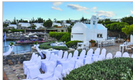
Preparation of the wedding venue for late afternoon ceremony

If you're seeking an enchanting location to experience your dream wedding, the luxurious St Nicolas Bay offers everything you may wish for, plus all the 'know how' to wow you and your guests. A comprehensive package has been put together for couples arranging their wedding and stay (minimum 5 nights), which we highly recommend. Another package option, with less inclusions, is available for non-residents. With the ceremony taking place late afternoon on a panoramic terrace located next to the picturesque chapel, a splendid sea view setting is guaranteed for the start of your married life.