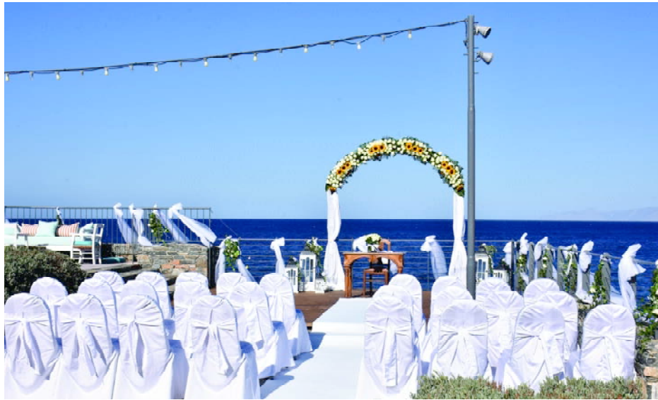
An enchanting seaview setting