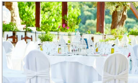
The on-site restaurant, a perfect venue for your reception